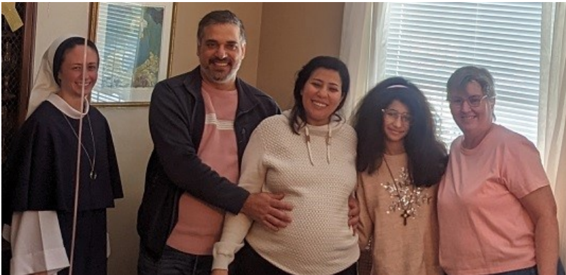
The Sisters of Life are very thankful to the Knights of Columbus, cancel 5036, and the Ladies auxiliary in conjunction with humanitas of Saint Cecilia's, for sponsoring baby shower for a young family who has chosen life for their baby. It was a very successful event and a good time was had by all.